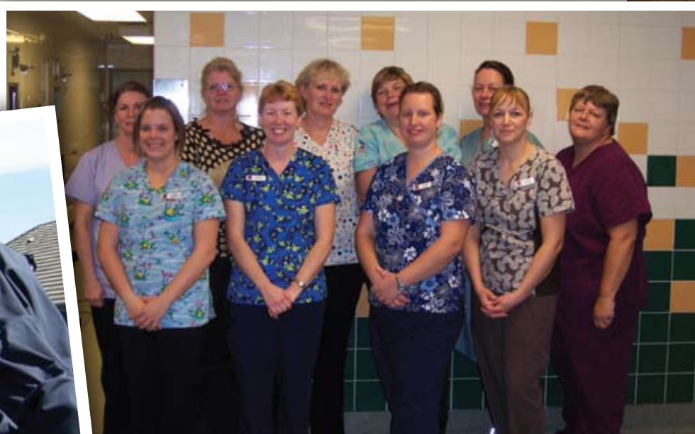
Some of our dedicated dietary staff.